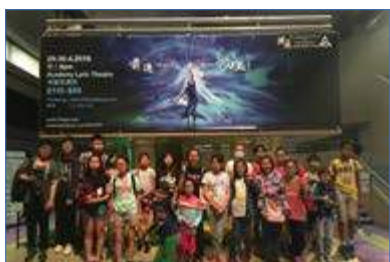
「元朗·天水圍青少年音樂劇團」 — 全數資助 Yuen Long • Tin Shui Wai Youth Musical Theatre Group — fully sponsored