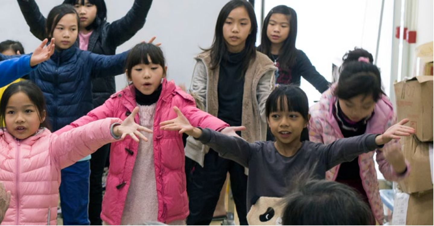
「Muse Up! 青少年音樂劇團」——全數資助 Muse Up! Youth Musical Theatre Group - fully sponsored