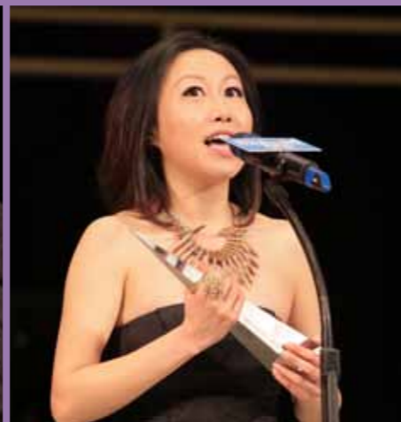
本地獎項殊榮 Local Accolades