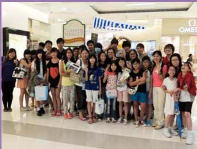
公關、採訪及其他活動 PR, Media and Other Activities