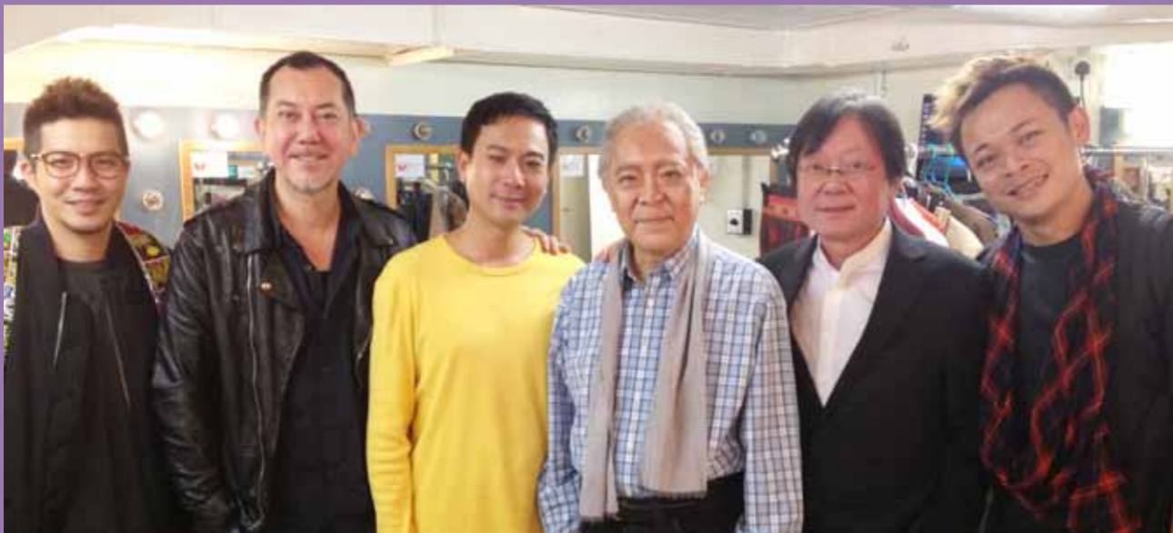
好友及嘉賓支持 Friends and Honourable Guests