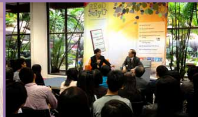
公關、採訪及其他活動 PR, Media and Other Activities