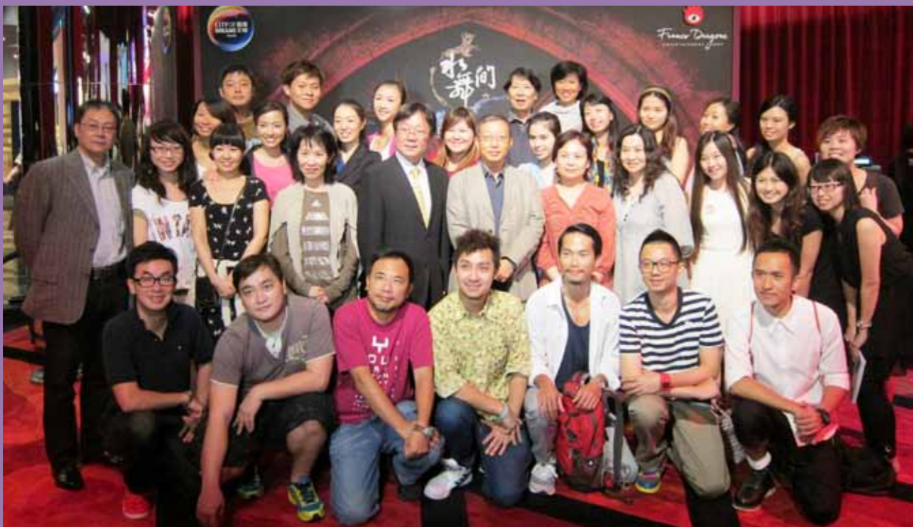
外訪文化交流 Outbound Cultural Exchange