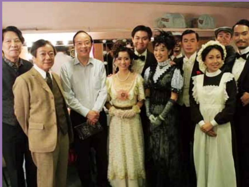
好友及嘉賓支持 Friends and Honourable Guests